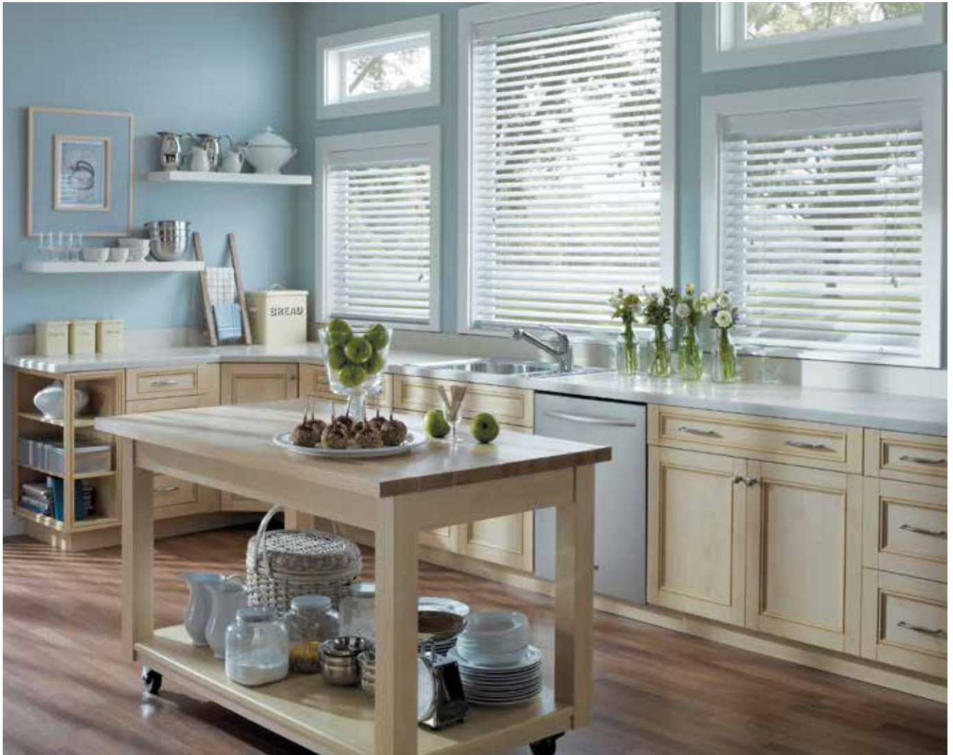
50mm Timber Venetians