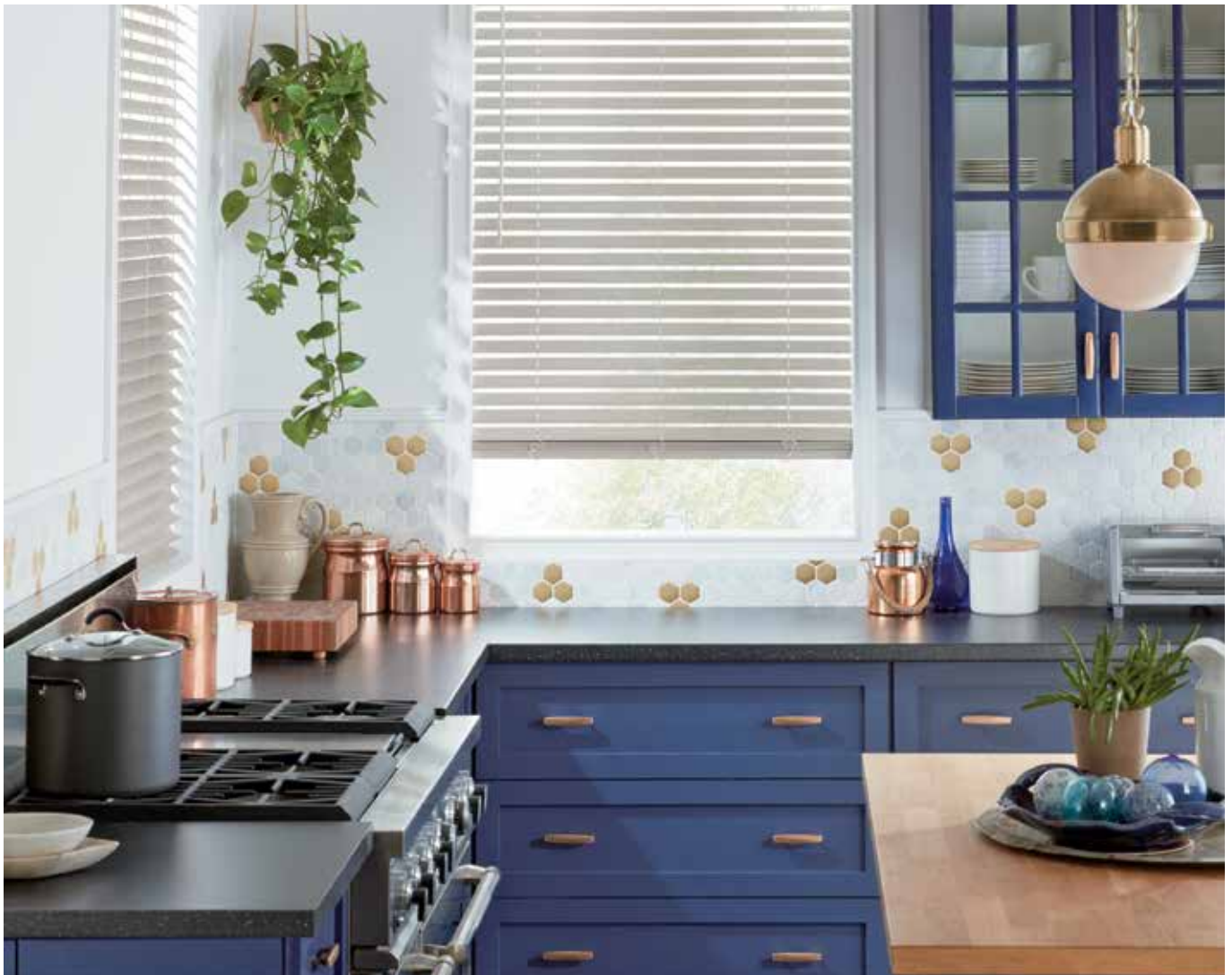
50mm Woodmates® Venetians