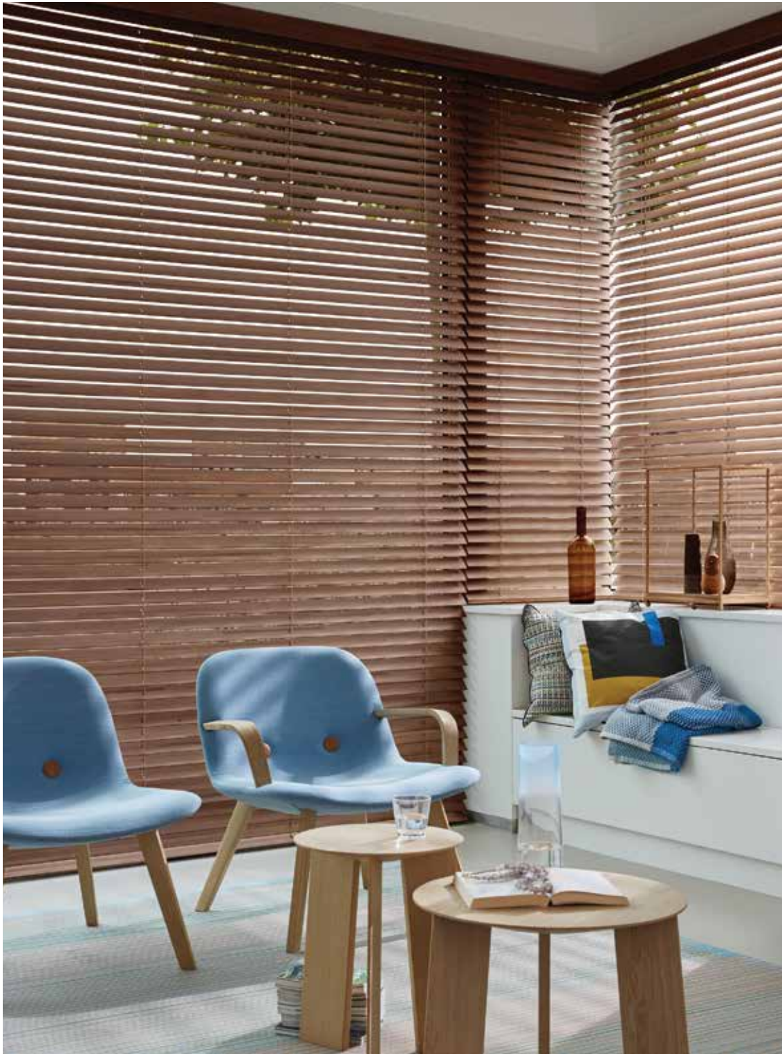
50mm Timber Venetians