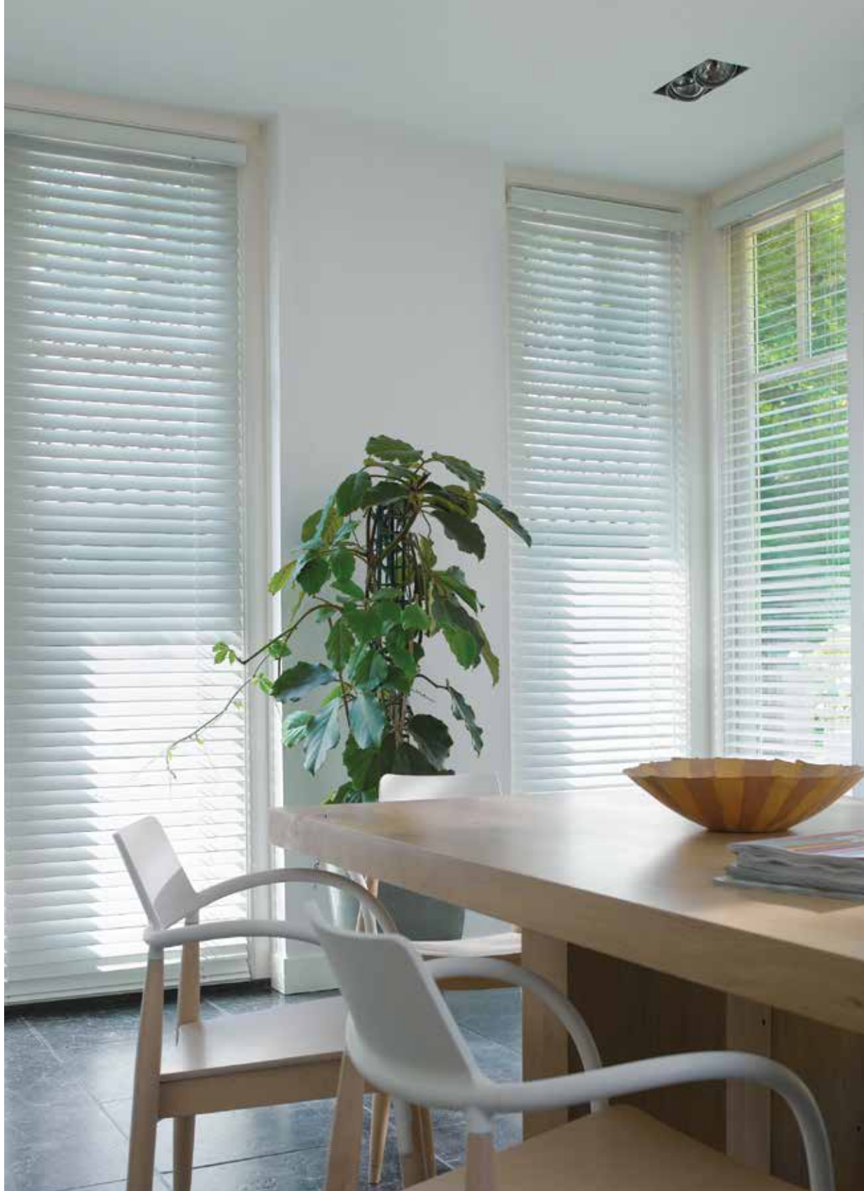
50mm Woodmates® Venetians