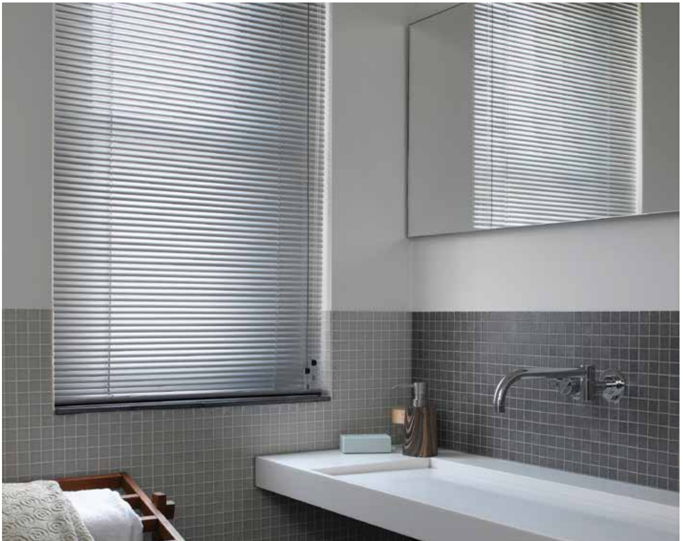
25mm Aluminium Venetians